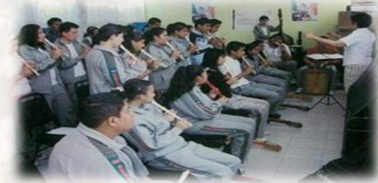
Training for Teachers